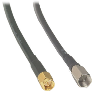
cable detail RG58 (Leoni Dacar 110)