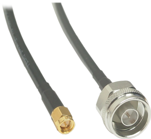
cable detail RG58 (Leoni Dacar 110)