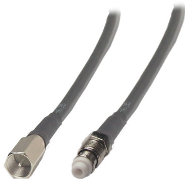
cable detail RG58 (Leoni Dacar 110)